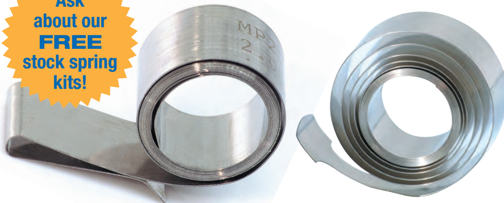
Various spring end types available

Constant Force Springs provide a smooth and efficient force for moving product in a P-O-P slide tray.